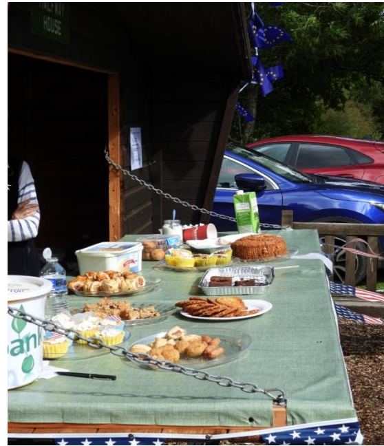
Fundraising at Puckrup Golf Club

That said, to maintain the sustainability of what we do, we're constantly on the lookout for new ideas and opportunities - so please do get in touch!